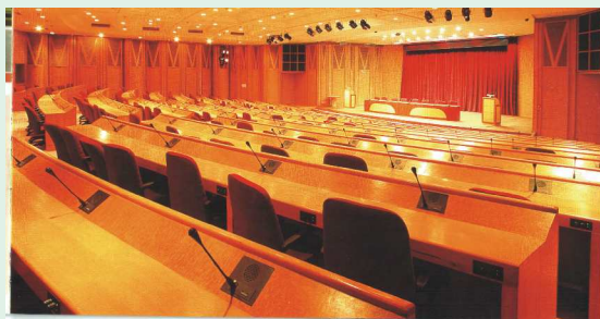
Symposium Hall, NASC Complex